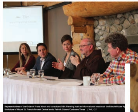
Representatives of the Order of Friars Minor and consultant BMA Planning host an informational session at the Ranchhouse about the future of Mount St. Francis Retreat Centre lands.

Published on April 15, 2019 | Last Updated April 15, 2019 1:55 PM EST